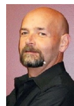
Letter from The Board President

Only one ballot per person. Ballots will only be available at the board office—they will not be mailed, faxed or emailed. The Slate of Candidates along with their bio appears in this newsletter and the information regarding the election and voting will be emailed to all members in September. The proposed 2018 Budget will also be sent at the end of September. Please make sure you add lpcar@lpcar.com and lpcar@frontier.com to your safe senders list to receive information and updates.